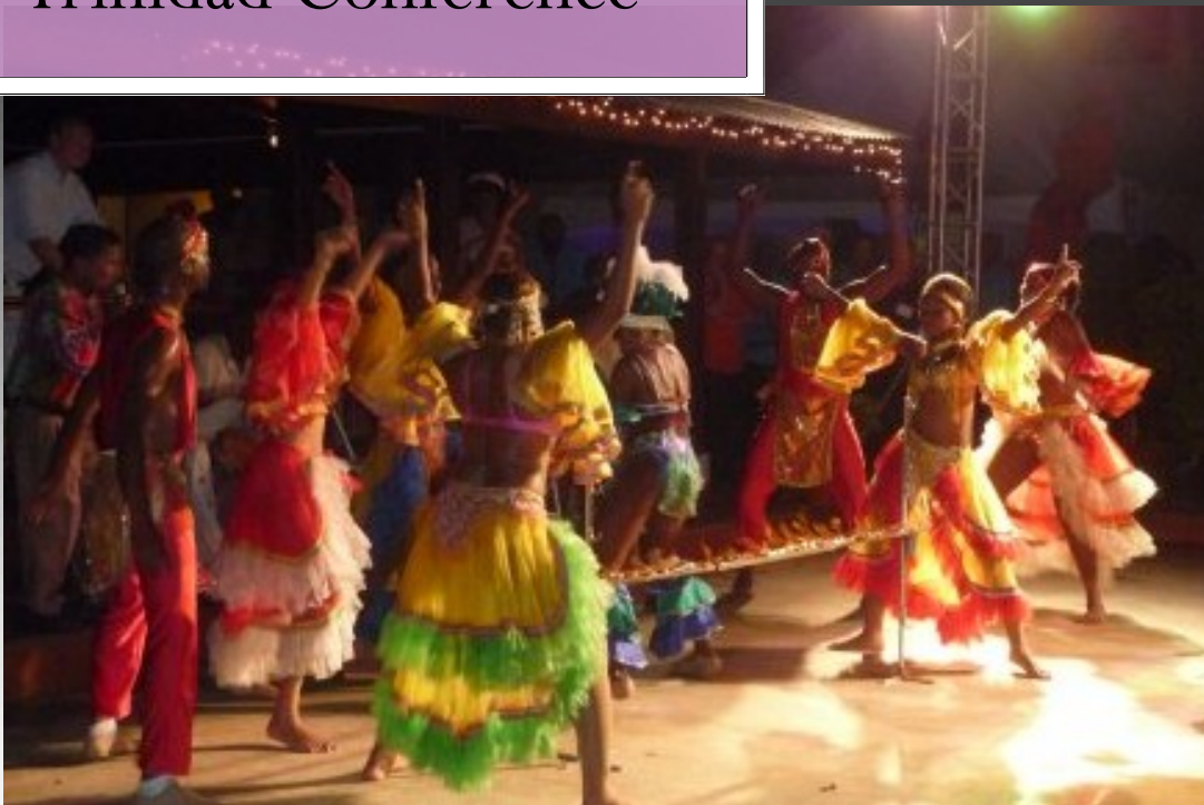
Festival Celebration at the Trinidad Gala