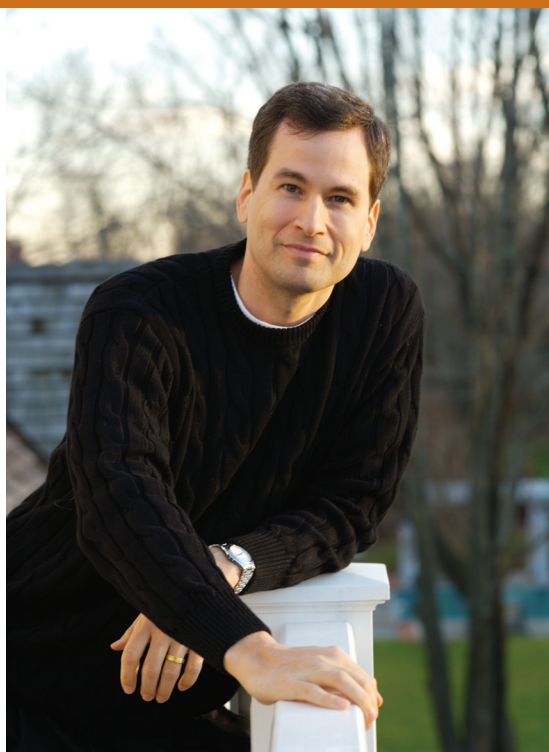
David Pogue, Technology columnist for the New York Times, opens CTC 2011 with a keynote address on October 4, 2011.