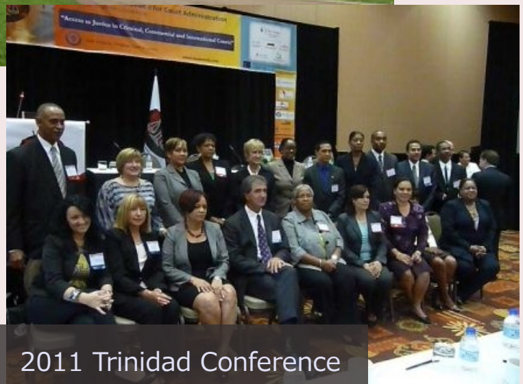
2011 Trinidad Conference