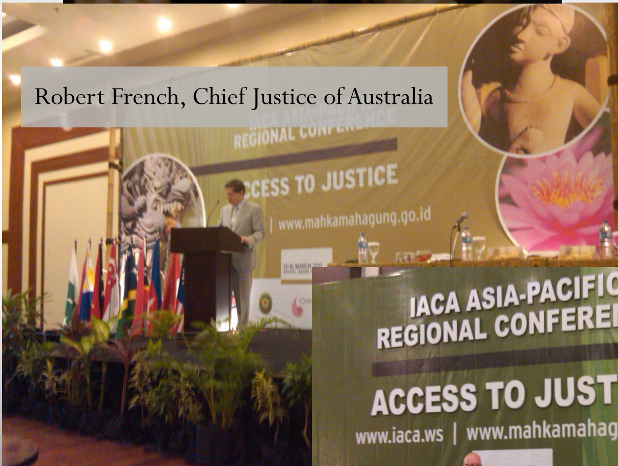
Robert French, Chief Justice of Australia

IACA ASIA-PACIFIC REGIONAL CONFERENCE ACCESS TO JUSTICE www.iaca.ws | www.mahkamahagung.go.id