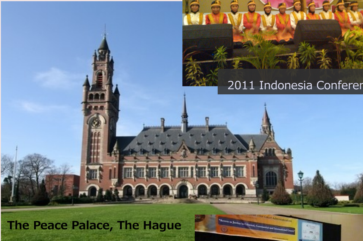
The Peace Palace, The Hague