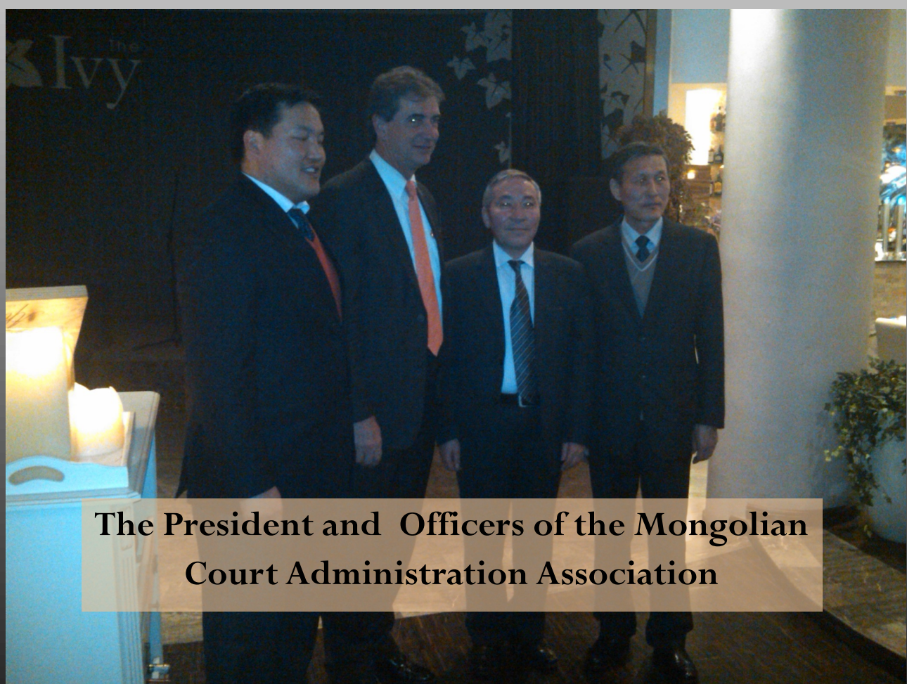
The President and Officers of the Mongolian Court Administration Association