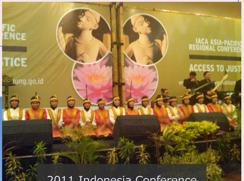
2011 Indonesia Conference